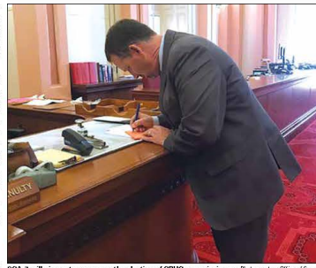
SCA 7 will give voters a say on the election of CPUC commissioners.

Senator Brian Dahle represents California's 1st Senate District, which contains all or portions of Alpine, El Dorado, Lassen, Modoc, Nevada, Placer, Plumas, Sacramento, Sierra, Siskiyou, and Shasta Counties.