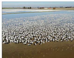
Snow geese take flight from the surface of a flooded rice field Jan. 31 in Willows.