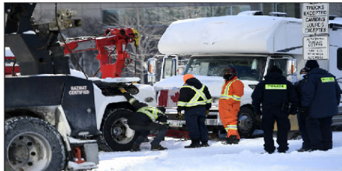
Police officers assist a tow operator to remove a truck from a blockade on Nicholas St. in Ottawa on Friday.

Tow truck operators — wearing neon-green ski masks, with their companies' details taped over on their trucks to conceal their identities — arrived under police escort and started removing the hundreds of big rigs, campers and other vehicles parked shoulder-to-shoulder near Parliament. Police smashed through the door of at least