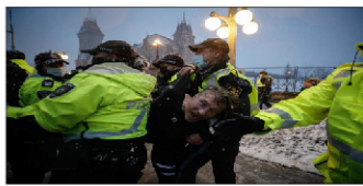
A man is arrested by police during a protest that continues to occupy downtown Ottawa, Ontario, on Thursday.

one RV camper before hauling it away. Scaffolds broke out in places, and police repeatedly went nose-to-nose with the protesters and pushed the crowd back amid cries of "freedom!" and the singing of the national anthem, "O Canada." Later police on horses were used to push back the crowd for a time.