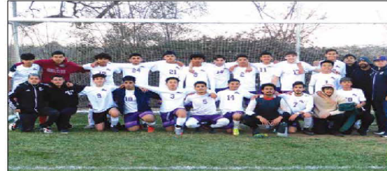
Members of the Live Oak High School Varsity Soccer team pose for a photo following a 1-0 victory over Gridley in the NSCIF.

Live Oak will play Wheatland in the NSCIF Finals on Saturday at 3:00 P.M. ★