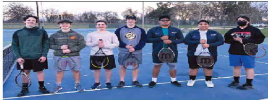
This year's GHS Tennis Team began its season on Thursday, February 24th.