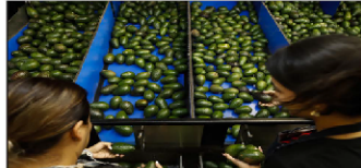
A worker selects avocados at a packing plant in Uruapan, Mexico, on Wednesday.

that today the U.S. Department of Agriculture's Animal Plant Health Inspection Service has determined it will immediately resume its avocado inspection program in Michoacan," Salazar wrote.